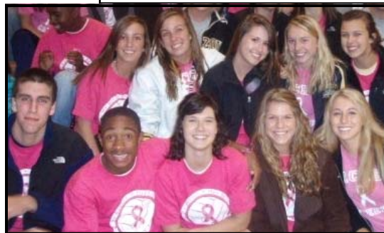
The Girls' Volleyball Team raised $3,721 for the Side-Out Foundation on Dig Pink Night.

Althoff Catholic students demonstrate their faith by helping others.